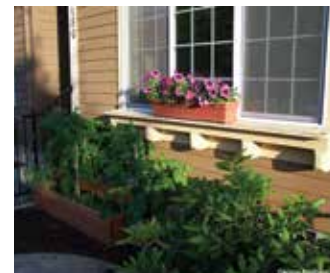
Complies with Zoning